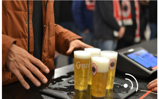
The RFID tags integrated in the cups are read at the Point of Sale.