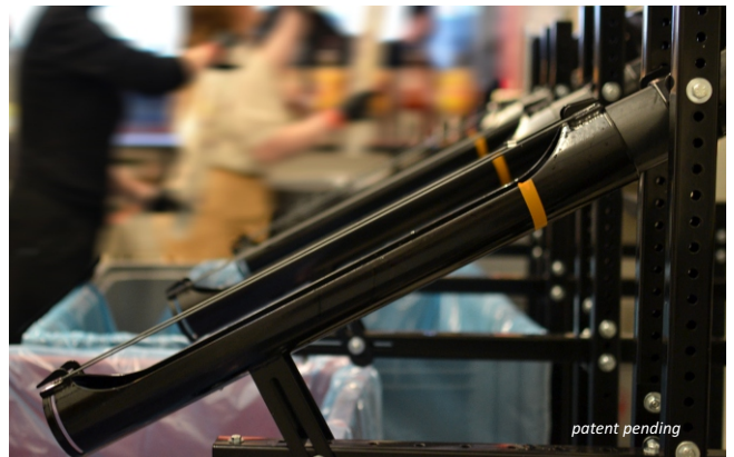
The returned cups are neatly stacked within the collection tubes specifically designed for the STAR concept.

STAR illustrates how creative technical solutions can solve practical challenges while ensuring sustainability and efficiency.